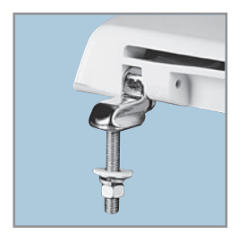
300 SERIES STAINLESS STEEL SELF-SUSTAINING HINGES (1950SS)