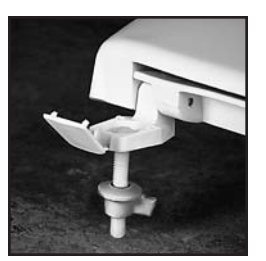
TOP-TITE® HINGES FEATURE NO-SLIP WASHER