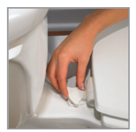
TWIST HINGES TO UNLOCK