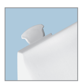
PLASTIC EASY•CLEAN & CHANGE™ HINGES

Hinges: Plastic Easy•Clean & Change™ Fastening System: Non-Corrosive Bolts and Wing Nuts