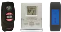
See our Ambient Technologies® catalog for a complete line of remotes and thermostats.