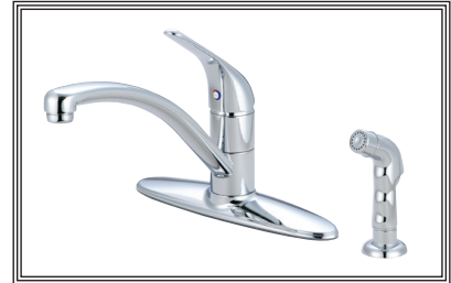
#2LG161 SHOWN * ADA