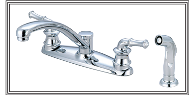
#2DM101 SHOWN * ADA