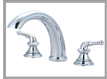
#4DM710T SHOWN * ADA