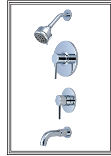
#4MT100T SHOWN * ADA