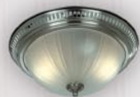
Models 741SNNT & 742SNNT