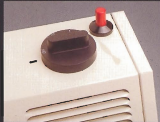
VFM Top Control