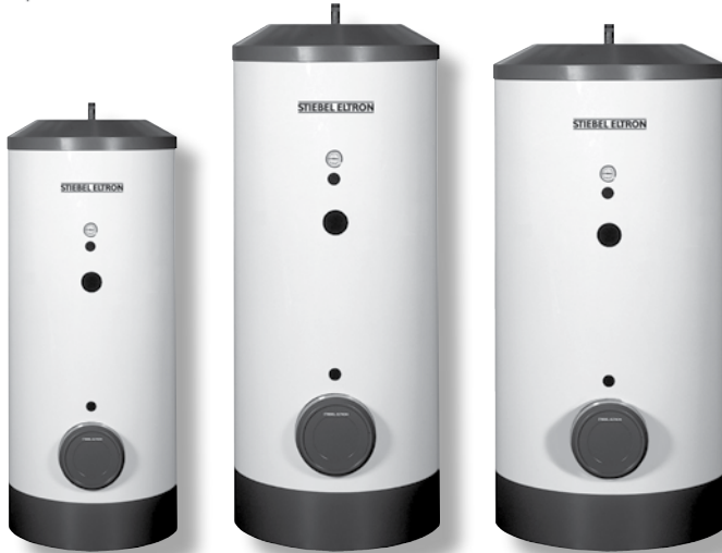
Left to right: SBB 300 SBB 400 SBB 600 Plus