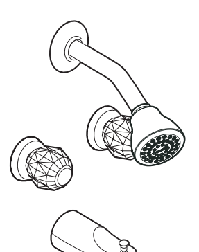
CHATEAU<sup>®</sup> Two-Handle Tub/Shower Valve and Trim