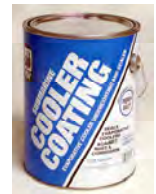
PREMIUM INTERIOR COATING