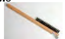
WIRE BRUSH & SCRAPER