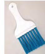
COARSE COATING BRUSH