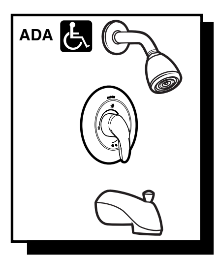
Villeta™ Posi-Temp® Single-Handle Tub/Shower Trim Kit

Models: TL2393, TL2393CP, TL2393P, TL2393PM, TL2393W (Bulk Packed 12 per carton)