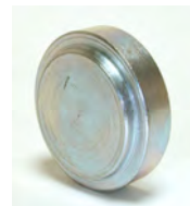
BLOWER SHAFT PLUG