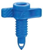
02918 BLS TAP-BL-50 1/2" BL-Swing Pipe Tap Only