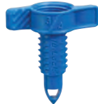
02920 BLS TAP-FP-75 3/4" FIPT Tap Only