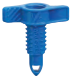
02919 BLS TAP-FP-50 1/2" FIPT Tap Only