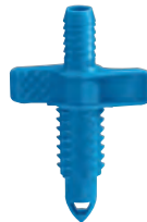
02019 BLS TAP-SB-50 1/2" SB Tap Only

To convert the Nitro Saddle to conventional swing pipe use part number 02019