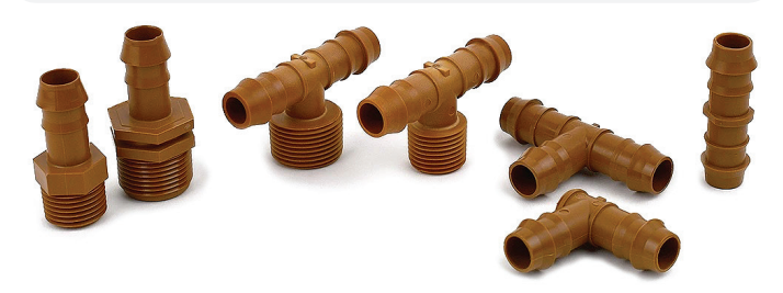
Use with T-EHW1554-010 or T-EHW1554-050 Blue Stripe tubing for 17mm, and all new i560 series barbed fittings or Tri-Loc series fittings!

*Test data collected in Toro's standardized 24-hour "grit test", used for qualifying all Toro low-flow Landscape and Agriculture products in an internal test lab.