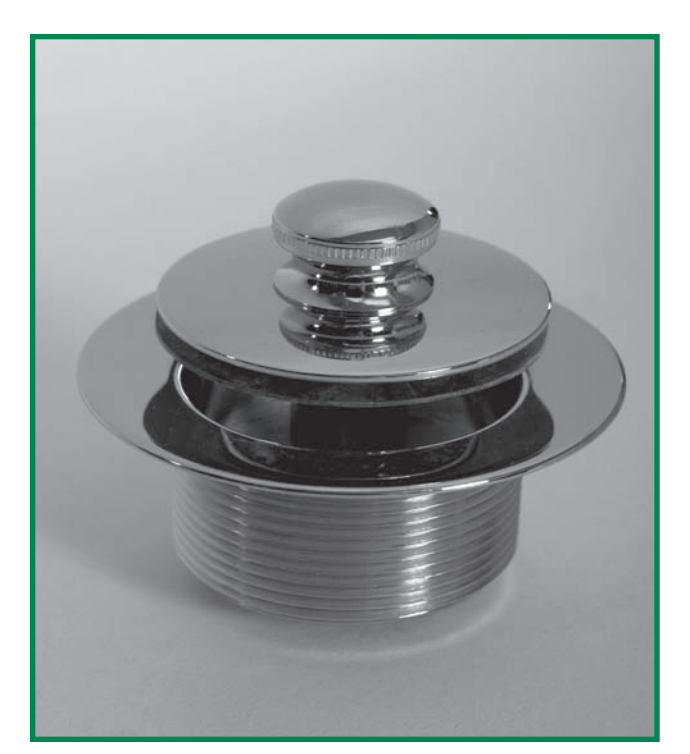
Also available in Foot Actuated stoppers. See items #68036, #68307, and #68308 in Finish chart to the right