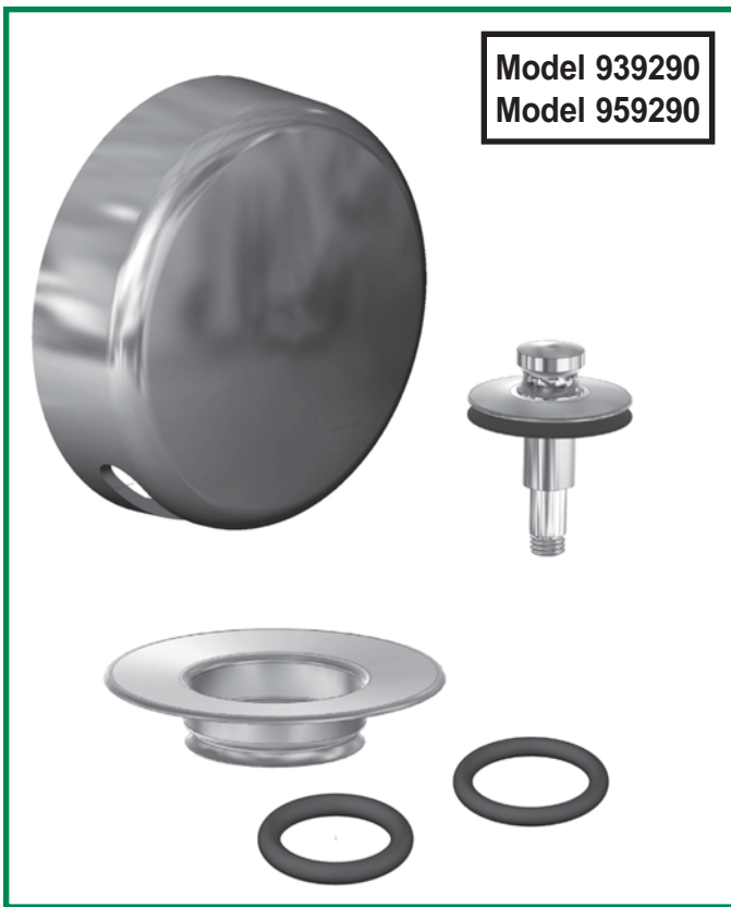
Model 939290 Model 959290