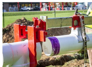
PPJ with PPJFA and PPJ6S