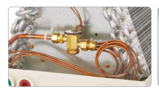
TXV with all threaded connections saves time in the field