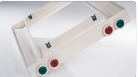
Patented HydroTEC<sup>™</sup> low water retention drain pan

Dual drain connections on each side for ease of installation