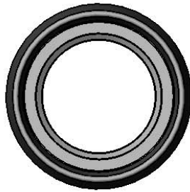
Black Tapered Rubber Bumper