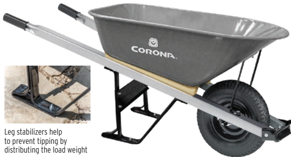
Leg stabilizers help to prevent tipping by distributing the load weight