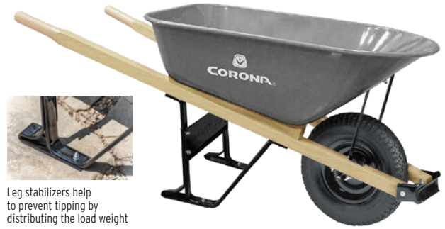
Leg stabilizers help to prevent tipping by distributing the load weight

Replacement parts fit WB 2706, WB 2706FF, WB 2706S, WB 2706SF