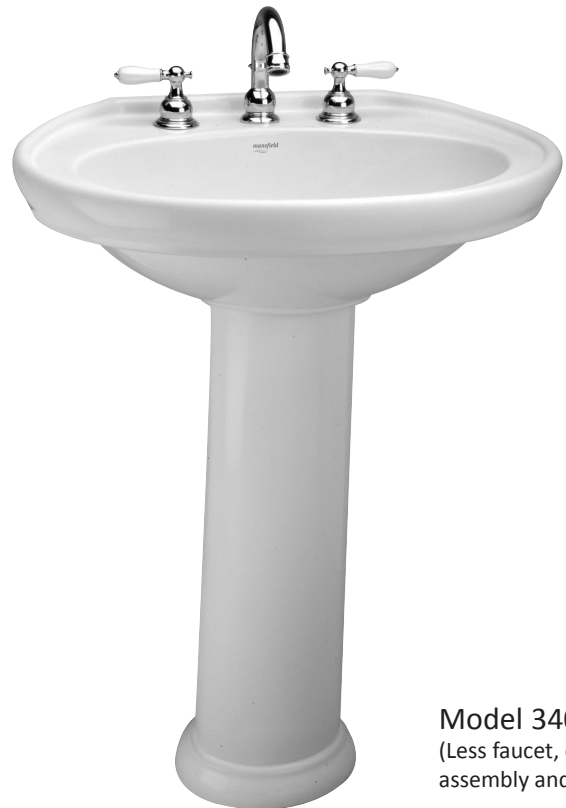
Model 340-8 (Less faucet, drain assembly and supply)