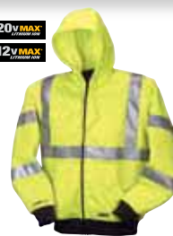
High Visibility Class III Hoodie