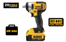
20V MAX* Lithium Ion 1/2" (13 mm) Impact Wrench Kit with Detent Pin