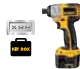
12V XRP™ 1/4" (6.35 mm) Impact Driver Kit