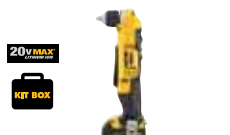
20V MAX™ Lithium Ion 3/8" (9.5 mm) Right Angle Drill/Driver Kit