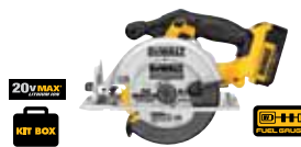
20V MAX* Lithium Ion 6-1/2" (165 mm) Circular Saw Kit