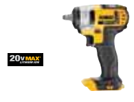
20V MAX* 3/8" (9.5 mm) Impact Wrench with Hog Ring (Tool Only)