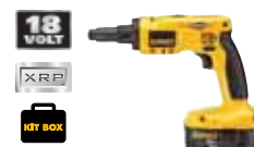
18V XRP™ Light Gauge Steel Framing Screwdriver Kit