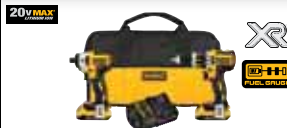
20V MAX* XR Lithium Ion Brushless 2-Tool Combo Kit