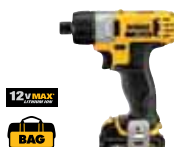
12V MAX* Lithium Ion 1/4" (13 mm) Screwdriver Kit