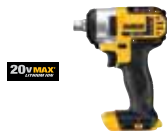
20V MAX* 1/2" (13 mm) Impact Wrench with Detent Pin (Tool Only)