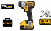
20V MAX* XR Lithium Ion Brushless 1/4" (6.35 mm) 3-Speed Impact Driver