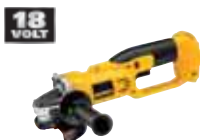
18V Cut-Off Tool (Tool Only)