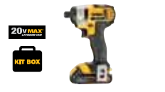
20V MAX* Lithium Ion 1/4" (6.35 mm) Impact Driver Kit