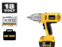
18V XRP™ Lithium Ion 1/2" (13 mm) Impact Wrench Kit