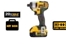
20V MAX* Lithium Ion 1/4" (6.35 mm) Impact Driver Kit