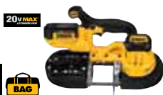
20V MAX* Lithium Ion Band Saw