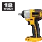
18V 1/2" (13 mm) Impact Wrench (Tool Only)