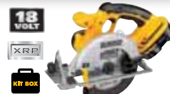
18V XRP™ 6-1/2" (165 mm) Circular Saw Kit