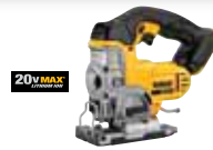
20V MAX* Jig Saw (Tool Only)