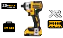
20V MAX* XR Lithium Ion Brushless 1/4" (6.35 mm) Impact Driver Kit