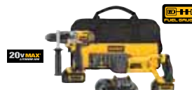
20V MAX* Lithium Ion 2-Tool Combo Kit