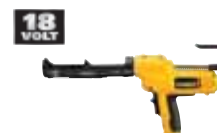
18V Adhesive Dispenser - 10 oz (Tool Only)