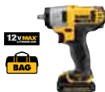
12V MAX™ Lithium Ion 3/8" (9.5 mm) Impact Wrench Kit