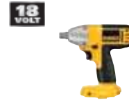
18V 1/2" (13 mm) Impact Wrench with Detent Pin Anvil (Tool Only)