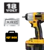
18V XRP™ 3/8" (9.5 mm) Impact Wrench Kit