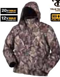
TRUE TIMBER® HTC Camo Jacket