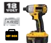
18V XRP™ 1/4" (6.35 mm) Impact Driver Kit