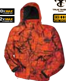
TRUE TIMBER® Blaze Camo