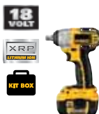
18V XRP™ Lithium Ion 1/2" (13 mm) Impact Wrench Kit