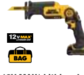
12V MAX* Lithium Ion Pivot Reciprocating Saw Kit