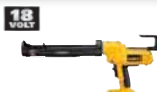
18V Adhesive Dispenser - 29 oz (Tool Only)