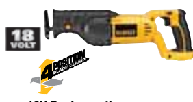
18V Reciprocating Saw (Tool Only)