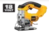
18V Jig Saw w/ Keyless Blade Change (Tool Only)