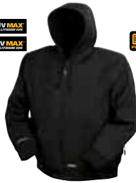
Hooded Work Jacket