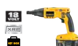
18V XRP™ 1/4" (13 mm) Drywall/Deck Screwdriver Kit