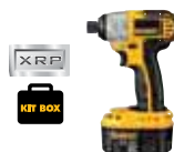
14.4V XRP™ 1/4" (6.35 mm) Impact Driver Kit