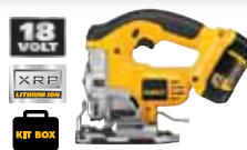
18V XRP™ Lithium Ion Jig Saw Kit