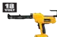
18V Adhesive Dispenser - 10 oz