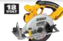
18V 6-1/2" (165 mm) Circular Saw (Tool Only)