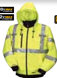
High Visibility Class III 3-in-1 Hooded Jacket