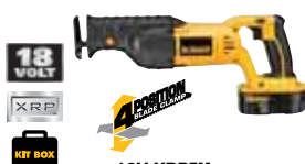
18V XRP™ Reciprocating Saw Kit