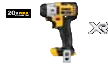
20V MAX* XR Brushless 1/4" (6.35 mm) 3-Speed Impact Driver (Tool Only)