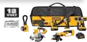
18V XRP™ 6-Tool Combo Kit