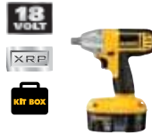
18V XRP™ 1/2" (13 mm) Impact Wrench Kit with Detent Pin Anvil