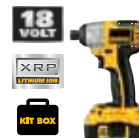
18V XRP™ Lithium Ion 1/4" (6.35 mm) Impact Driver Kit