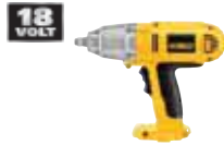
18V 1/2" (13 mm) High Torque Impact Wrench with Hog Ring Anvil (Tool Only)