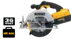
36V Lithium Ion 7-1/4" (186 mm) Circular Saw Kit