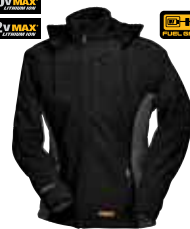
Women's Jacket with Removable Hood