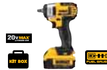
20V MAX* Lithium Ion 3/8" (9.5 mm) Impact Wrench with Hog Ring Kit