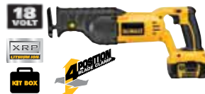
18V XRP™ Lithium Ion Reciprocating Saw Kit