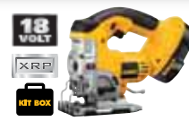
18V XRP™ Jig Saw Kit w/ Keyless Blade Change