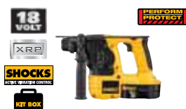
18V XRP™ 7/8" (22 mm) SDS Hammer Kit