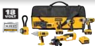
18V XRP™ Lithium Ion 6-Tool Combo Kit