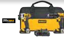
20V MAX* Lithium Ion 2-Tool Combo Kit