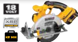
18V XRP™ Lithium Ion 6-1/2" (165 mm) Circular Saw Kit