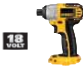
18V 1/4" (6.35 mm) Impact Driver (Tool Only)