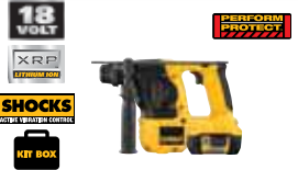
18V XRP™ Lithium Ion 7/8" (22 mm) SDS Rotary Hammer Kit