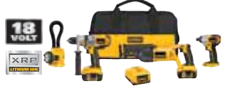
18V XRP™ Lithium Ion 4-Tool Combo Kit