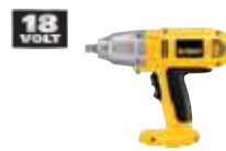
18V 1/2" (13 mm) High Torque Impact Wrench with Detent Pin Anvil (Tool Only)