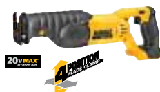
20V MAX* Reciprocating Saw (Tool Only)