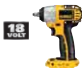
18V 3/8" (9.5 mm) Impact Wrench (Tool Only)