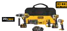
20V MAX* Lithium Ion 4-Tool Combo Kit