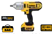
20V MAX* Lithium Ion 1/2" (13 mm) Impact Wrench Kit with Detent Pin Anvil