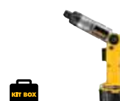
7.2V 1/4" (6.35 mm) Two-Position Screwdriver Kit