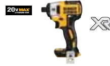
20V MAX* XR Brushless 1/4" (6.35 mm) Impact Driver (Tool Only)