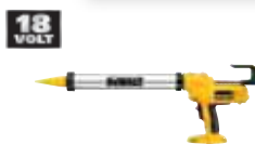
18V Adhesive Dispenser - 300 ml (Tool Only)