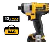
12V MAX* Lithium Ion 1/4" (6.35 mm) Impact Driver Kit