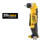
20V MAX™ 3/8" (9.5 mm) Right Angle Drill/Driver (Tool Only)