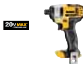
20V MAX* 1/4" (6.35 mm) Impact Driver (Tool Only)