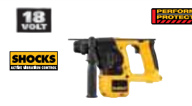
18V 7/8" (22 mm) SDS Hammer (Tool Only)