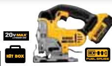
20V MAX* Lithium Ion Jig Saw Kit