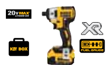
20V MAX* XR Lithium Ion Brushless 1/4" (6.35 mm) Impact Driver Kit