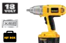
18V XRP™ 1/2" (13 mm) High Torque Impact Wrench Kit with Detent Pin Anvil