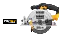
20V MAX* 6-1/2" (165 mm) Circular Saw (Tool Only)