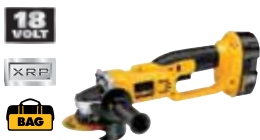
18V XRP™ Cut-Off Tool Kit