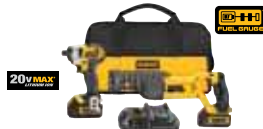
20V MAX* Lithium Ion 4-Tool Combo Kit