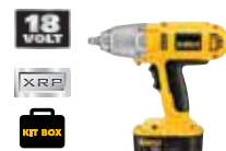
18V XRP™ 1/2" (13 mm) High Torque Impact Wrench Kit with Hog Ring Anvil