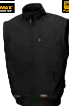
Jacket with Removable Sleeves