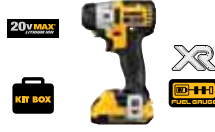
20V MAX* XR Lithium Ion Brushless 1/4" (6.35 mm) 3-Speed Impact Driver