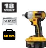
18V XRP™ 1/2" (13 mm) Impact Wrench Kit