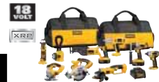
18V XRP™ 9-Tool Combo Kit