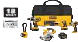
18V XRP™ 5-Tool Combo Kit