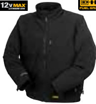
Soft Shell Work Jacket