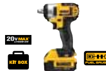
20V MAX* Lithium Ion 1/2" (13 mm) Impact Wrench Kit with Hog Ring Anvil