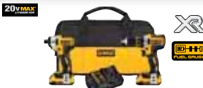
20V MAX* XR Lithium Ion Brushless 2-Tool Combo Kit