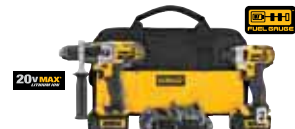
20V MAX* Lithium Ion 2-Tool Combo Kit