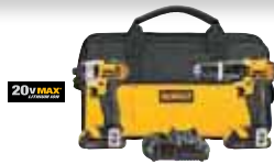
20V MAX* Lithium Ion 2-Tool Combo Kit