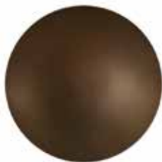
OIL RUBBED BRONZE (RB)