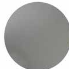
BRUSHED STAINLESS (BS)