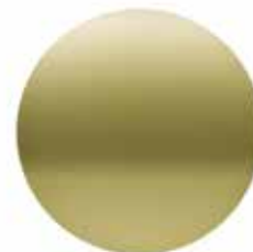
POLISHED BRASS (PB)