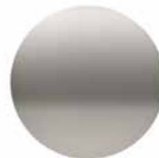
POLISHED STAINLESS (PS)