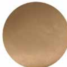
BRUSHED BRONZE (BB)