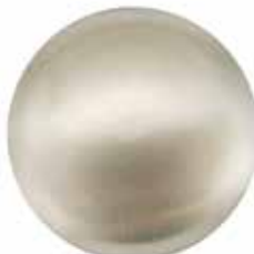
SATIN NICKEL (SN)