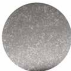
ANTIQUÉ PEWTER (AP)