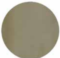
POLISHED NICKEL (PN)