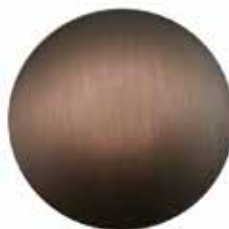
OLD WORLD BRONZE (WB)