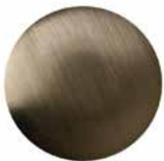
ANTIQUÉ NICKEL (AN)