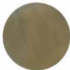
ANTIQUÉ BRASS (AB)