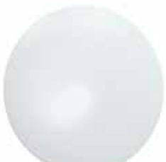
POLAR WHITE (PW)