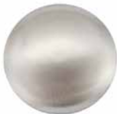
BRUSHED NICKEL (BN)