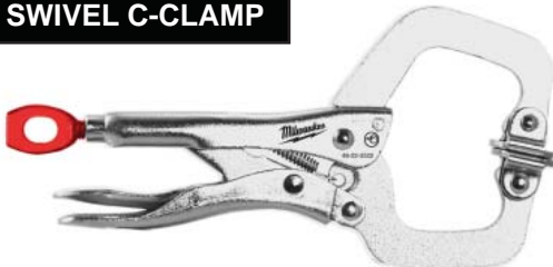
48-22-3521 11" Swivel C-Clamp 48-22-3522 6" Swivel C-Clamp

NOTE: As an aid to installing a service replacement spring onto a TORQUE LOCK™ clamping device, draw back the Adjustment Bolt (1) to allow for the end of the middle pivot plate in the lower handle assembly to be freed through the round opening in the upper handle. Expand open the lower handle assembly as shown.