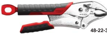
48-22-3405 5" Curved Jaw 48-22-3407 7" Curved Jaw 48-22-3410 10" Curved Jaw