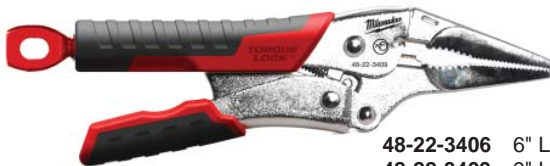
48-22-3406 6" Long Nose 48-22-3409 9" Long Nose