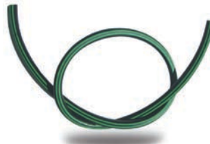
Up to 30% More Flexible than Competitors