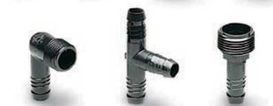
SBE-050 SB-TEE SBA-075