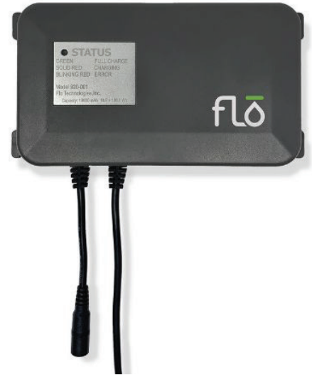
Flo by Moen™ Lithium Ion Battery Backup Model: 920-001

*Please note that applicable laws and regulations require that these materials be shipped via ground transportation rather than air.