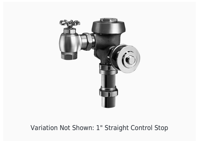
Variation Not Shown: 1" Straight Control Stop