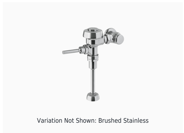
Variation Not Shown: Brushed Stainless