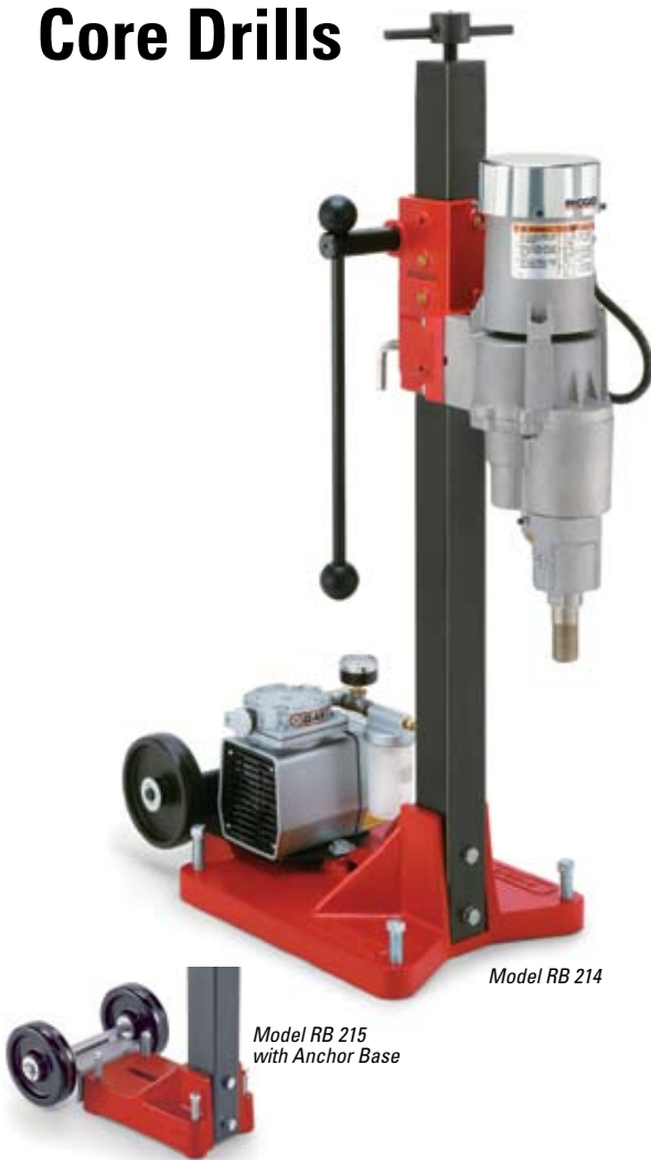
Model RB 214