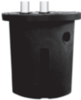
Fig. 31 Duolift System

Grundfos Duolift Systems are suitable for the collection and pumping of wastewater below sewer level from cellars/basements of private homes (shower, bath, washing machine, and toilets), hospitals, industries, hotels, restaurants, etc.)