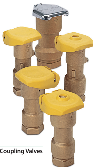
Quick Coupling Valves